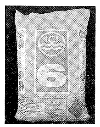
Figure 2 Some ICI fertilizers