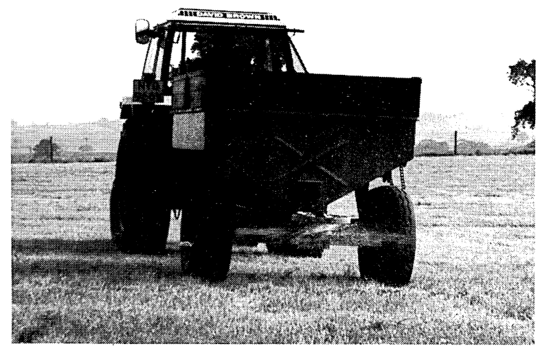
Figure 1 Applying fertilizer on farmland

Plants need certain elements in order to grow heathily. They can get most of these elements from the soil, but three elements are sometimes in short supply. These are nitrogen, N, phosphorus, P and potassium K. Table 1 shows the effect on plants of a shortage of each of these three elements.